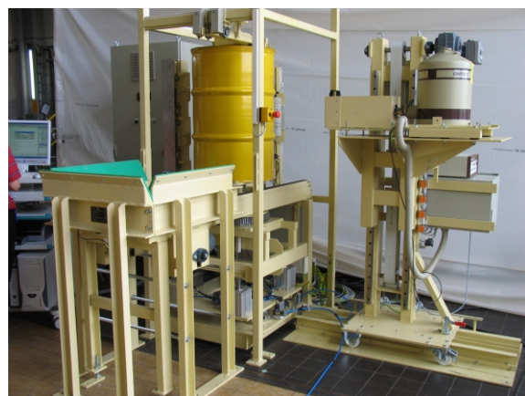
Figure 2. Drum monitoring system

The movement of the mechanical components is automatic and controlled by a PC. The data of the detector systems are registered and evaluated in a specified time grid, which allows a local interpretation of the gamma flux around the drum. The operation can be carried out from a shielded area and is controlled using menus in the specific language of the customer's country.