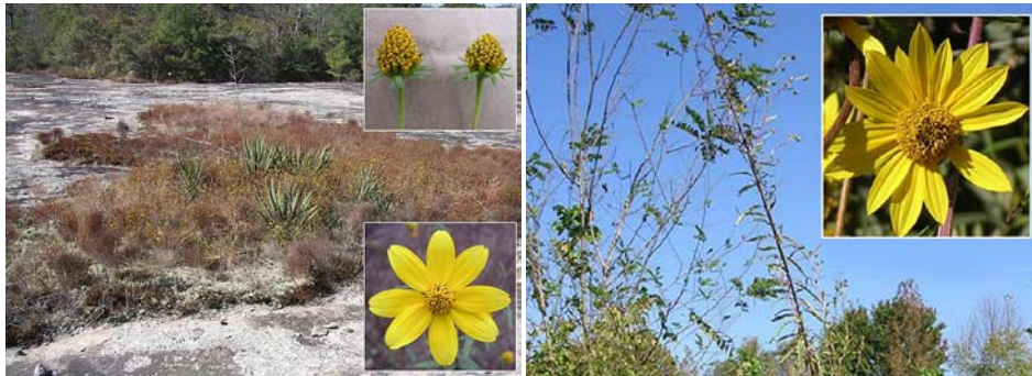
Figure 3: Typical granite rock outcrop site for Helianthus porteri in northern Georgia, showing “islands” of vegetation in shallow depressions. Upper right insert shows conical form of mature seed heads, and lower right insert shows flower in bloom, with notched ray petals.

latter site is owned by the US Air Force and the H. eggertii sites are managed by prescribed burns by base personnel. The other collections were from AL (2) and SC (1). Population sizes varied from ~100 plants to several thousand (as documented by AEDC surveys). The 13 collections span a significant portion of the geographic distribution of H. eggertii and presumably capture a wide genetic diversity. Enough seed was collected to make nine of the 13 available for distribution (Table 2). Helianthus eggertii is also reported in at least 11 counties of Kentucky, but no sites in KY were visited during this trip. Helianthus eggertii seeds were the largest of any species collected during the trip, averaging 0.75 g/100 seeds. Seeds of all the other collected species averaged 0.26 g/100 seeds or less.